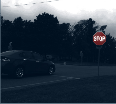
LOW AMBIENT LIGHT CONDITIONS