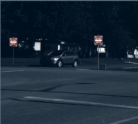
PERPENDICULAR OR OFFSET ANGLE